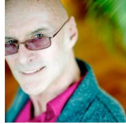
Ken Wilber. Founder of Integral Theory

"The central idea of Simpol is very powerful. That is, how to link votes in one country with votes in another; how to link political action in one country with action in another. International competition is built-in to the nation- state system at its current level of development, and so the issue is not environmental concerns, but how to get humans to agree on environmental concerns. This is really fascinating and very hopeful. In my opinion this is the crucial issue for the 21st Century".